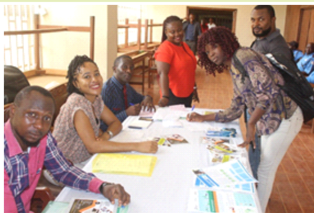
CERHI Staff at the CERHI-ICIPE Workshop