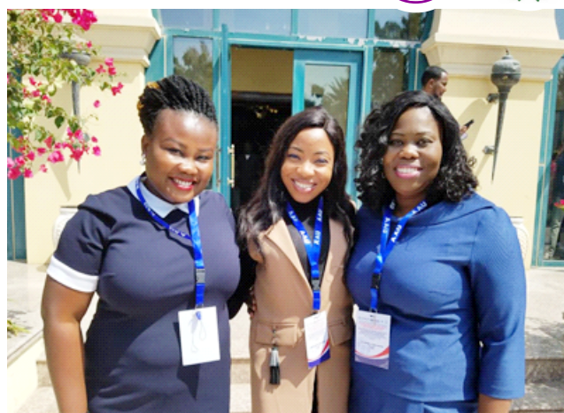
CERHI Program Manager, Project Accountant and Project M&E Officer

The boot camp ended with a plenary session titled “Pathway towards Sustainability”. This was followed by closing formalities. Participants were then treated to lunch before their final departure.