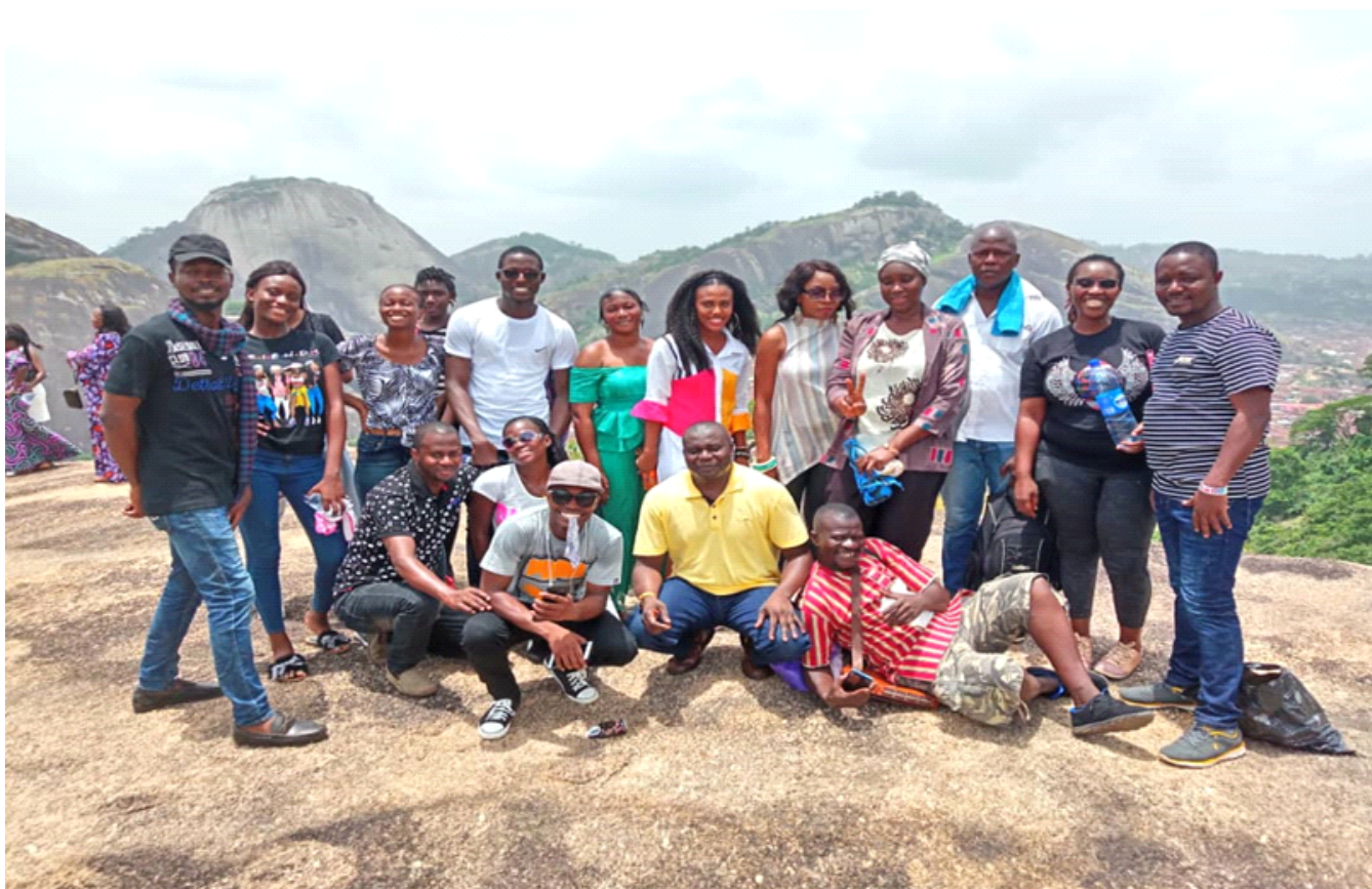
A group photograph of some CERHI Regional students on an Excursion

academic support, enriched activities galore, sports and cultural offerings, wellness and fitness programs, and endless opportunities to explore, engage, and better the community and the world.