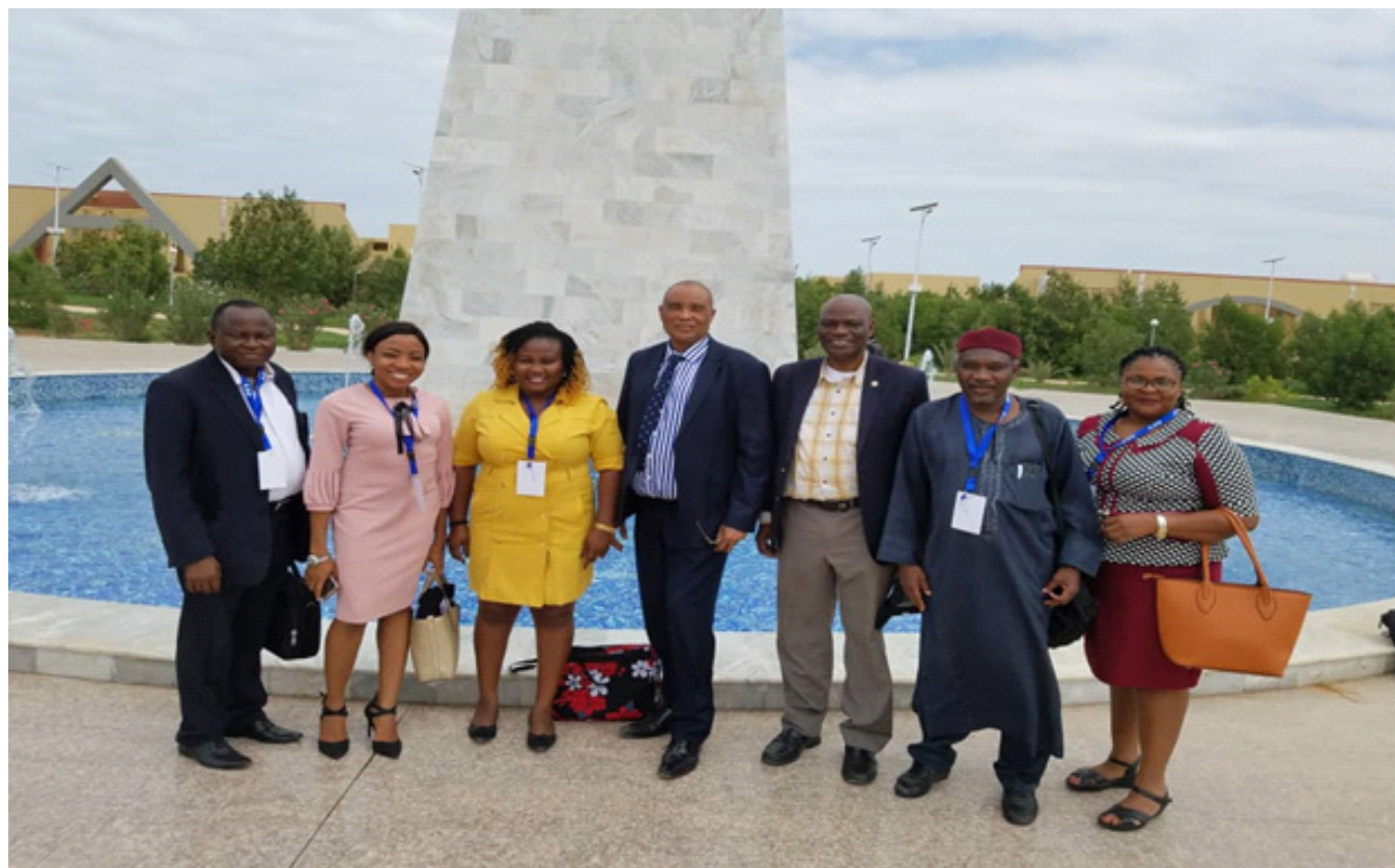
CERHI Team in picture at Djibouti

T he overarching objective of the Bootcamp was to provide participating centres, their host institutions, and governments with the tools necessary to improve their readiness for Project implementation.