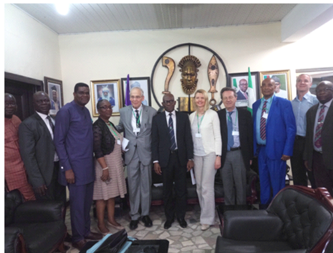
APHEA Team in a group photograph with the Deputy Vice Chancellor (DVC), Centre Leader, Co- Centre Leader and others during their visit

CERHI presently has students from Cameroon, Republic of Guinea, Malawi, Ghana, and the Gambia. The international accreditation of CERHI will attract more students from other parts of the continent. It also ensures that students who graduate from the program are well equipped with needed skills for the industry and can work anywhere in the world.