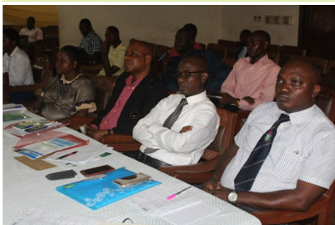
A photograph of CERHI Faculty (Community Health Department) at the CERHI-ICIPE Workshop