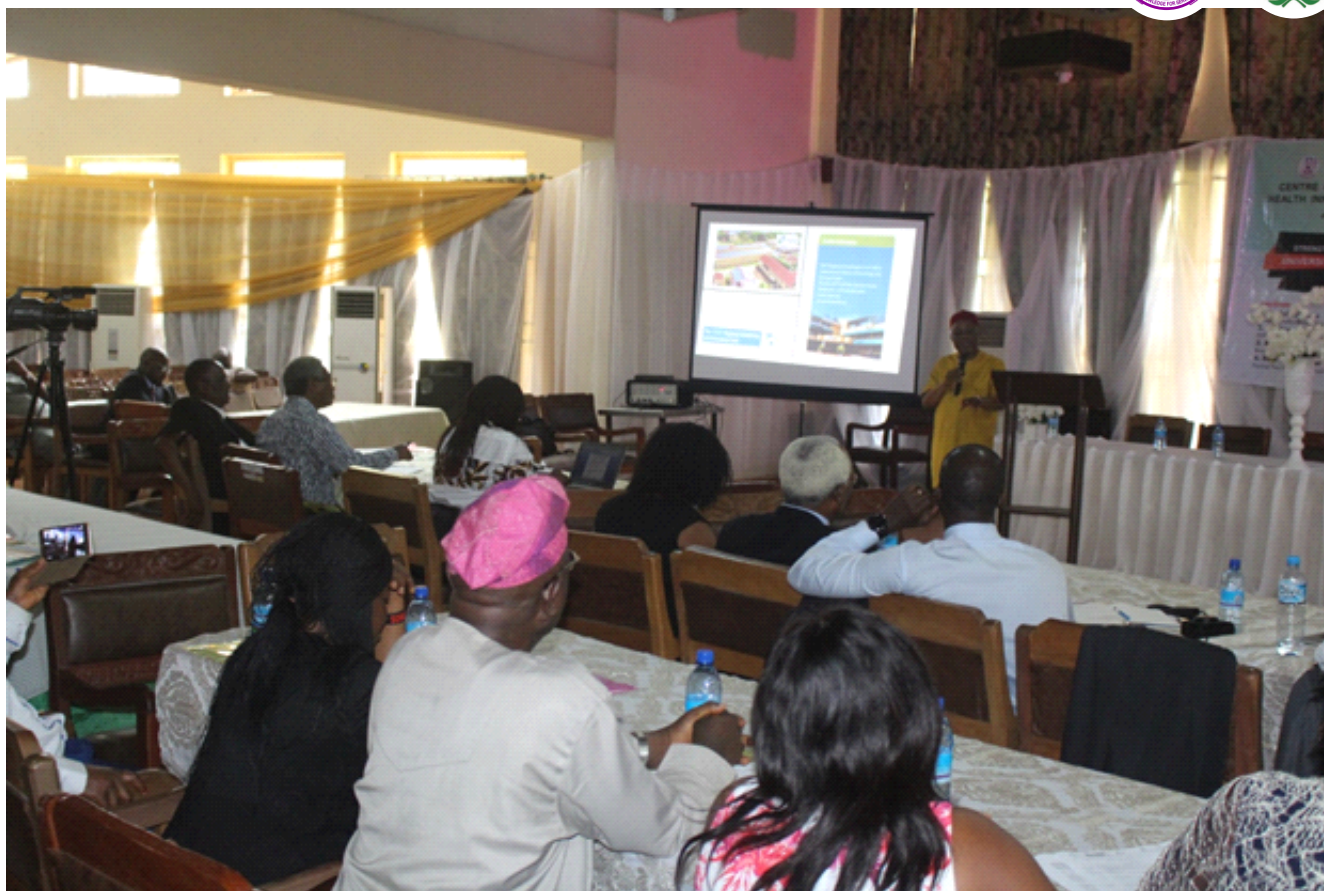
Photograph of Participants at the CERHI-ICIPE Workshop.