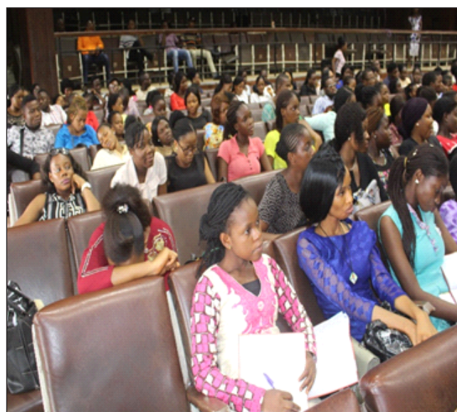
Participants at one of the Public Lecture