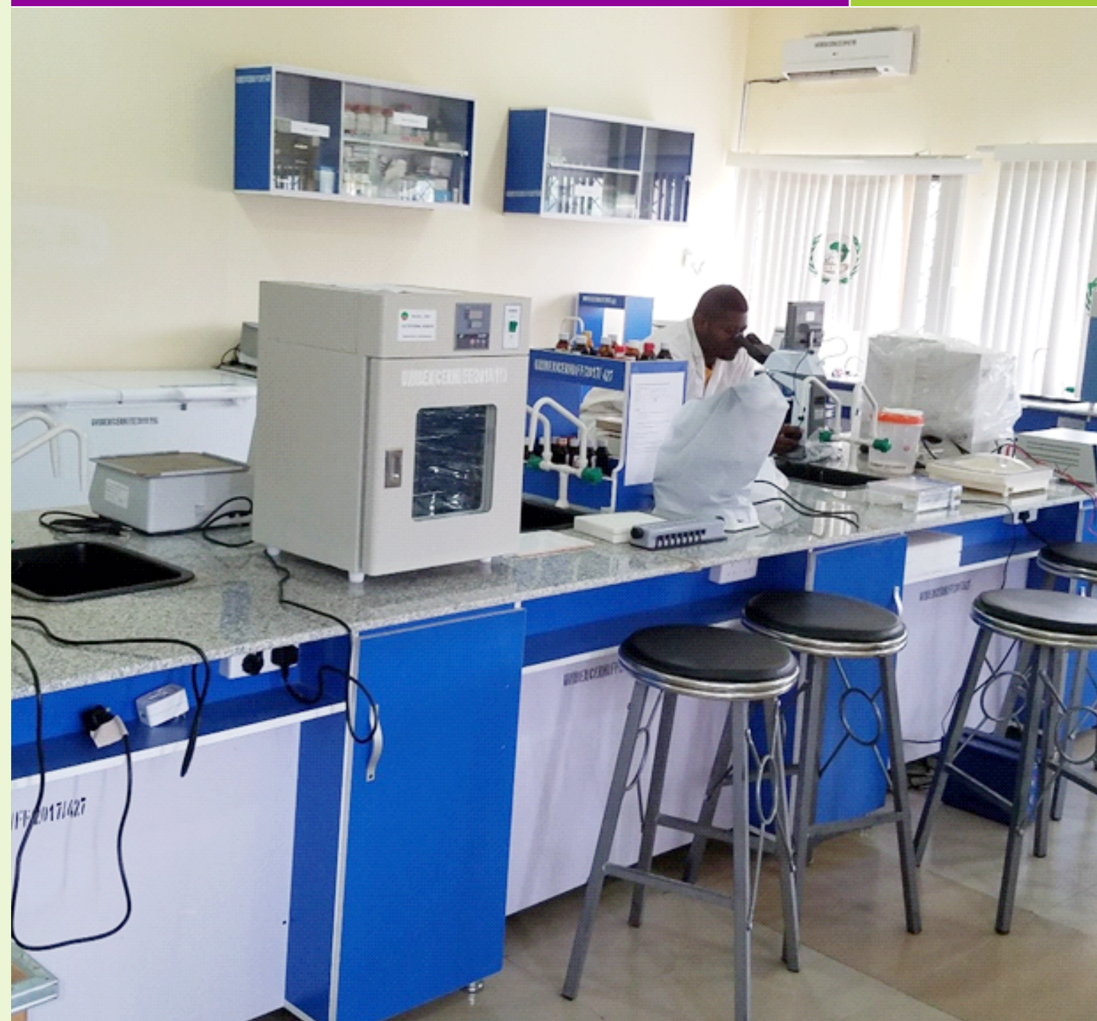
CERHI Medical and Research Laboratory (CMARL)

"CERHI... Advancing better reproductive health for West and Central Africa".