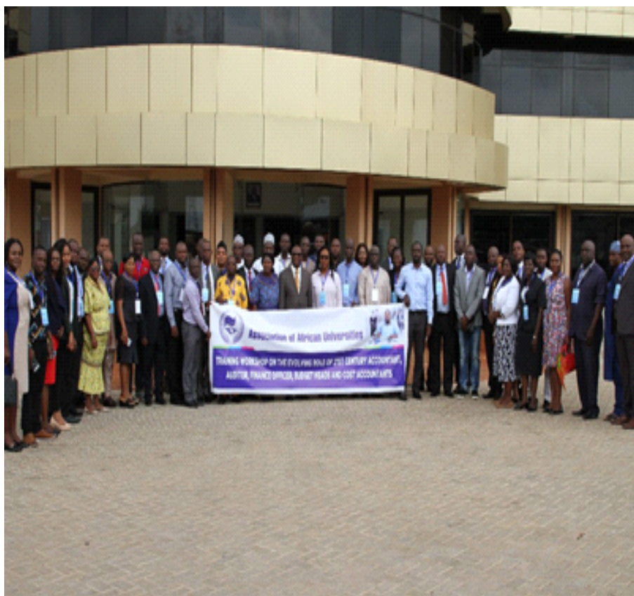
A group photograph of participants at the workshop.

In the quest to compete in a global environment, the role of financial professionals has changed significantly and is still changing. It is simply not enough for financial professionals to limit their roles to the legendary 'debit and credit' function. Surveys continue to indicate that finance personnel will become increasingly involved with activities such as interpreting information, assisting in decision-making, improving processes, and evaluating performance. Finance professionals must therefore become a key part of the driving force for continuous improvement throughout their organizations.