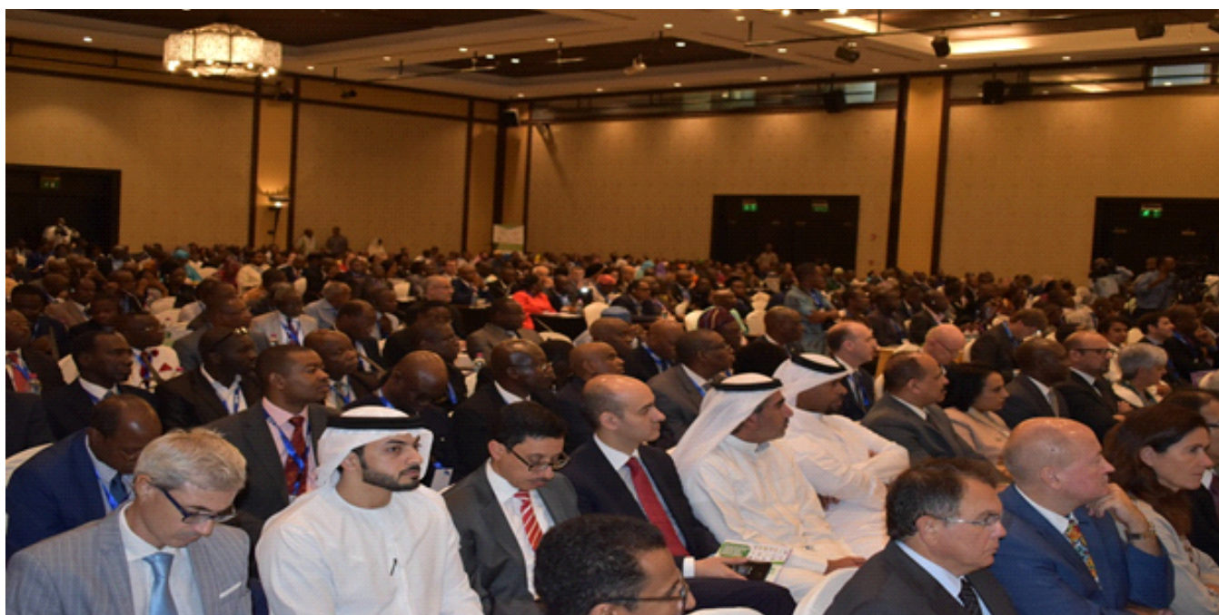
A photograph of participants at the ACE Impact Workshop in Djibouti

Each ACE Impact centre is expected to identify an aspect of a development challenge that can be addressed with an integrated program of work that is achievable over 4 ½ years project duration.