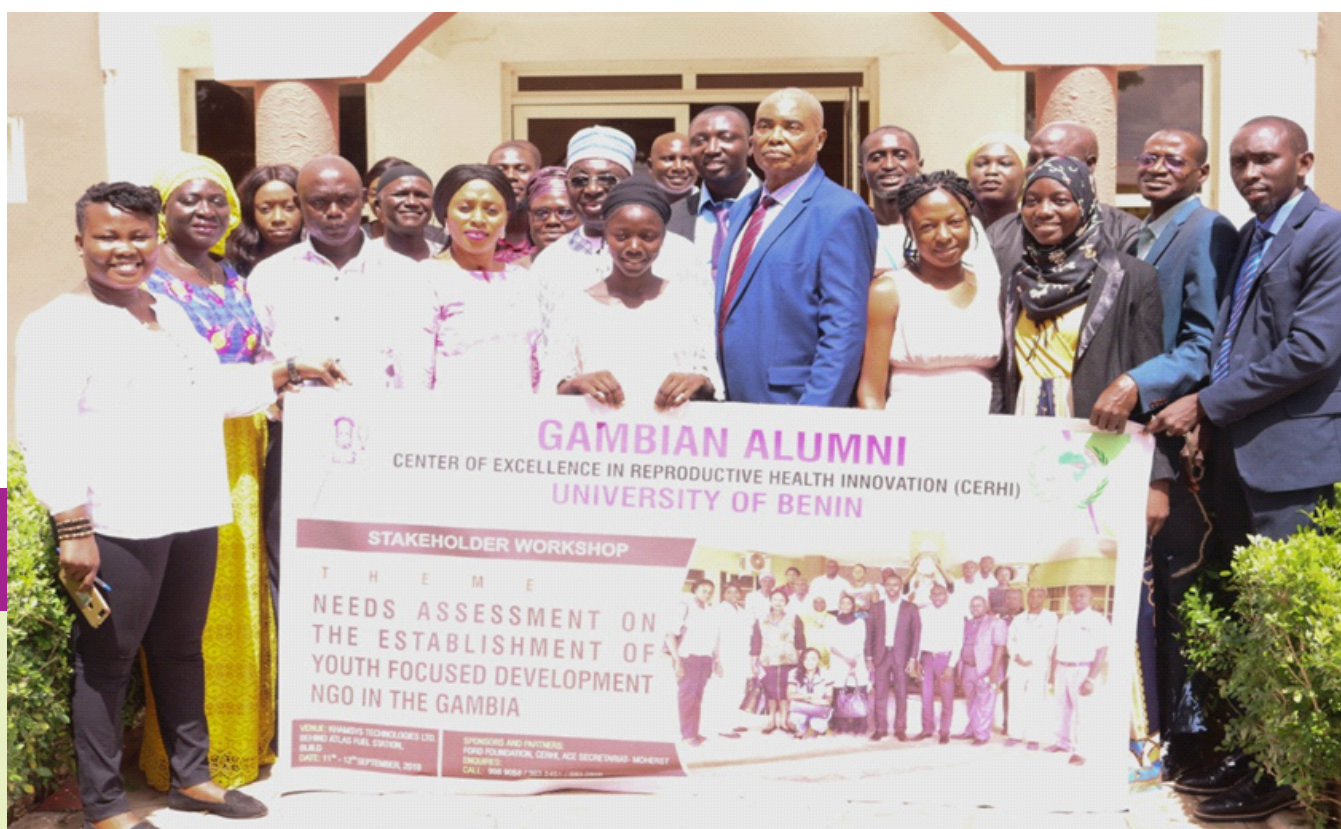
A group photograph of CERHI Gambia Alumni, CERHI Staff and other Stakeholders at the workshop.

CERHI, in partnership with the Ford Foundation, Government of the Gambia and the CERHI Alumni from the Gambia, established a Youth Focused Development NGO in the Gambia to enable the mainstreaming of youth development and provision of social safety net for youths in the Gambia. The first cohort of the students graduated from the Master's program of the Centre in December 2017 and the final PhD students are scheduled for their thesis defense in September 2019. CERHI in January 2016, admitted 17 students from the Republic of the Gambia to undergo Masters and PhD courses in Nursing, Reproductive Health and Public Health.