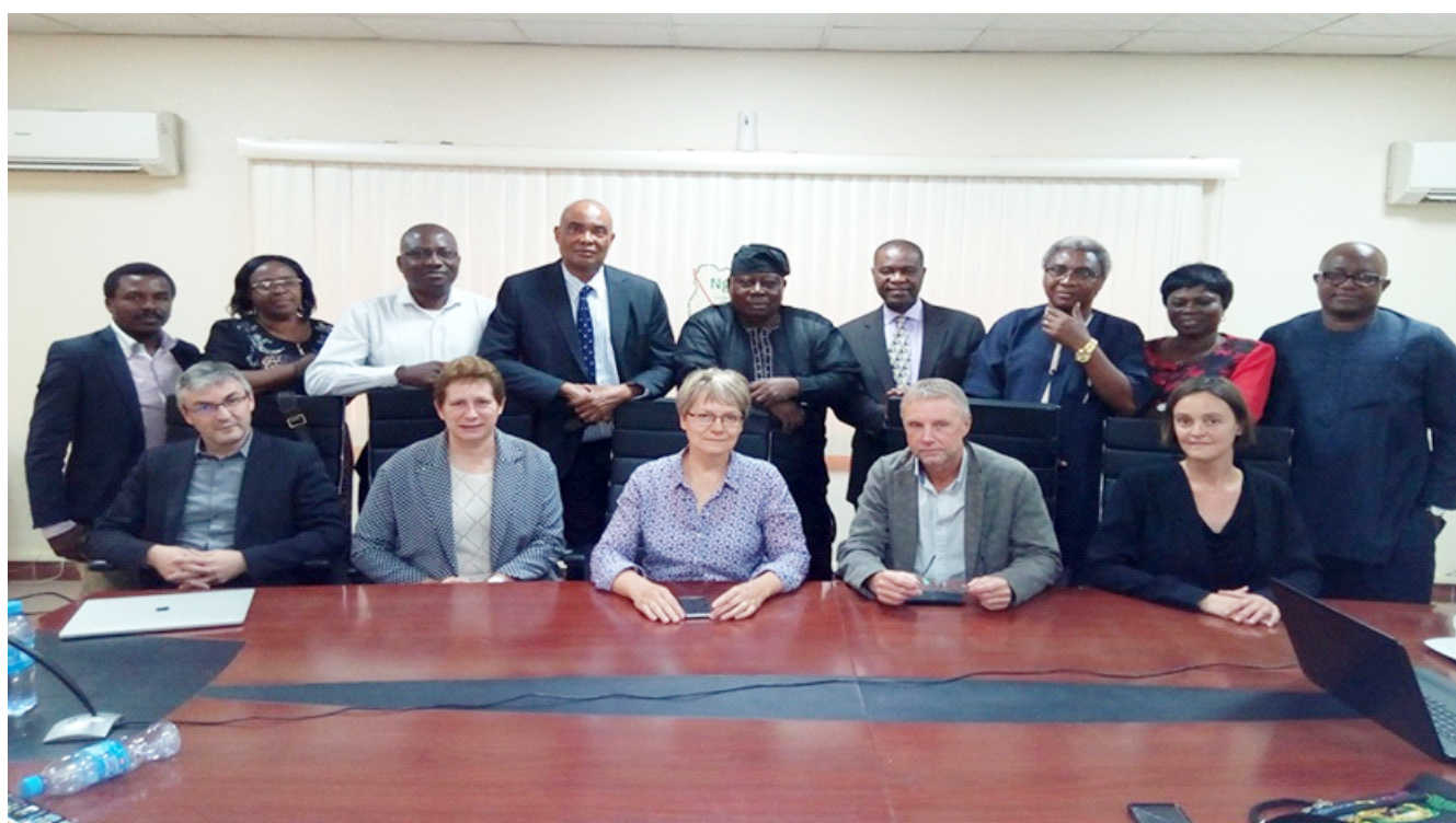
HCERES team (sitting in front) in a group photograph with CERHI Faculty and NUC staff (Abuja) during the onsite visit.

HCERES also ensures that the dissemination of scientific, technical and industrial results is taken into account in the higher education and research staff's careers.