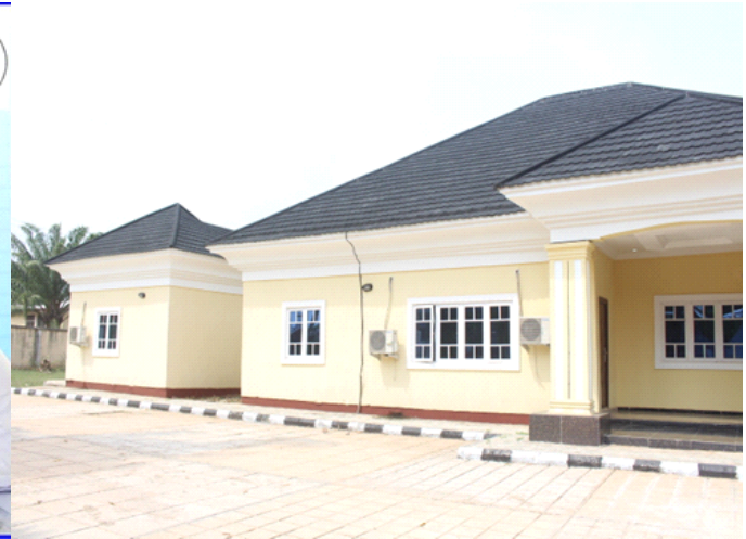
CERHI Laboratory Services