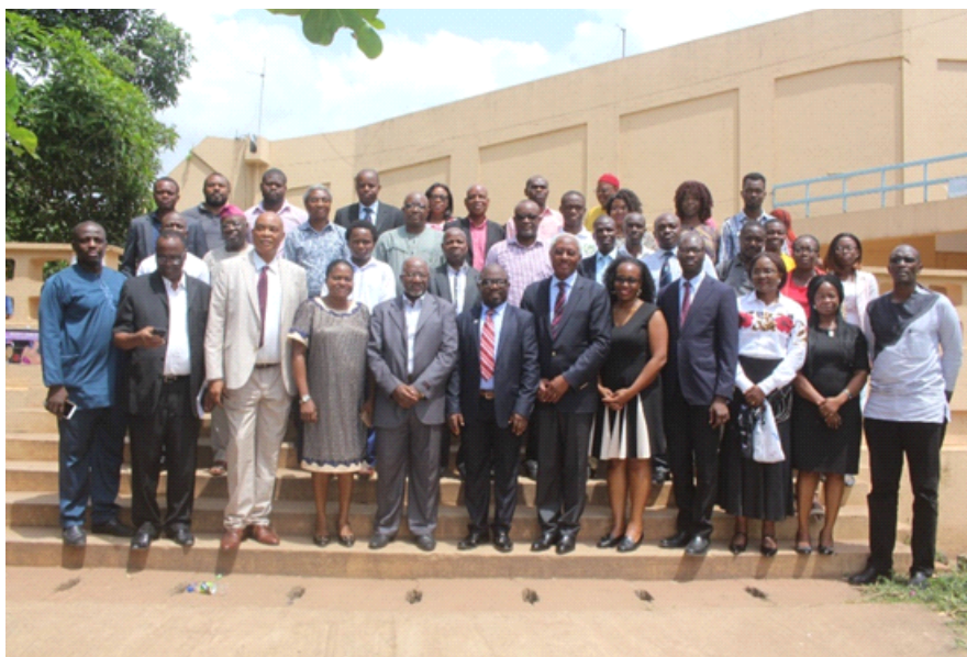
Participants and facilitators in a group photograph

The Centre of Excellence in Reproductive Health Innovation (CERHI), University of Benin, Nigeria organized a two-day regional workshop on “ Strengthening Innovation Ecosystems in Universities in West and Central Africa ” from April 29-30, 2019. The idea for the workshop was conceived during the 1st Africa-Japan Higher Education Partnership Workshop in Tokyo and Kyoto, Japan from October 22 to 26, 2018. The Japan Study Tour raised pertinent questions on the extent of innovation in African Universities and the need for this to be strengthened. CERHI thus collaborated with BioInnovate Africa and the Regional Scholarship and Innovation Fund (RSIF), both hosted by the International Centre of Insect Physiology and Ecology (icipe) in Nairobi, Kenya to organize the workshop